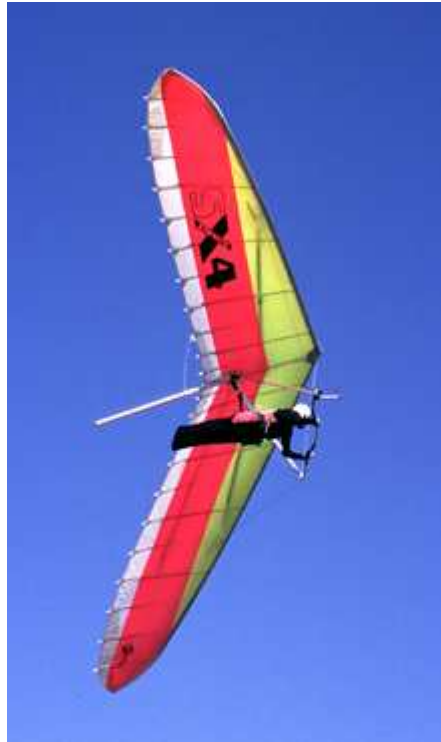
Hang Glider Flex Wing (above)